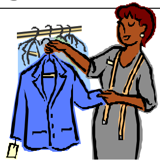
This is your chance to "SEW" your stuff!

Garment judging, with your shoes and accessories, will be April 14 at the 4-H Office/ NC Cooperative Extension-Cabarrus County Center. Stop by the office between 3:30-5:30 p.m.