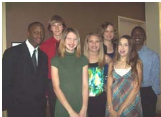
2008 State 4-H Council Conference attendees